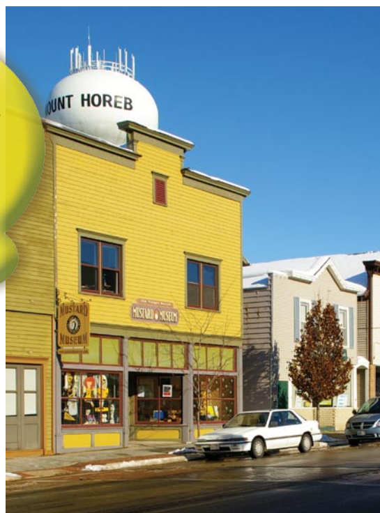
(ABOVE CENTER) Barry Levenson, the Maestro of Mustard. (ABOVE LEFT) A small portion of the Mustard Museum's collection of mustard tins. (RIGHT) The Mustard Museum is easy to find on Main Street in Mount Horeb, thanks to the subtle, mustard-colored façade.

The museum now contains around 4,900 mustards with more being added all the time, many of them from visitors. There are also many mustard