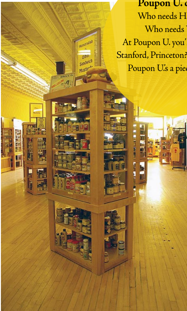
(BELOW LEFT) The museum gift shop. (BELOW RIGHT) Mustard art and the original French's mustard mascot. (RIGHT) Barry's newest literary masterpiece Mustard on a Pickle . The Mustard Museum is hosting a contest for the next great mustard-based children's story. The top two entries receive $2,500.

Poupon U. cheer: Who needs Harvard, Who needs Yale? At Poupon U. you'll never fail. Stanford, Princeton? Big mistake! Poupon U.'s a piece of cake.