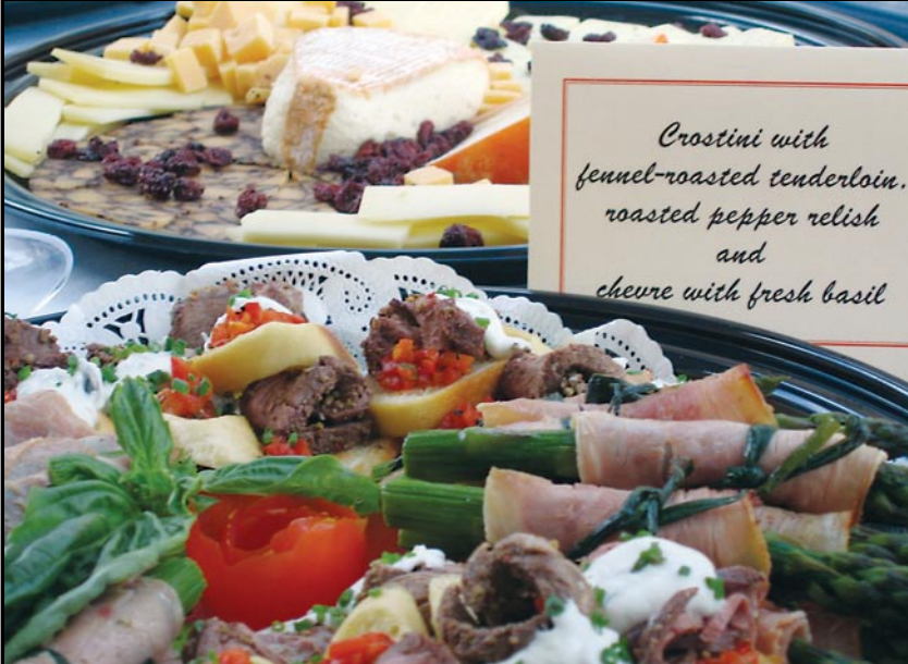
Crostini with fennel-roasted tenderloin, roasted pepper relish and chevre with fresh basil

1221 Williamson St., Madison open 7:30am–9:30pm daily (608) 251-6776 • www.willystreet.coop