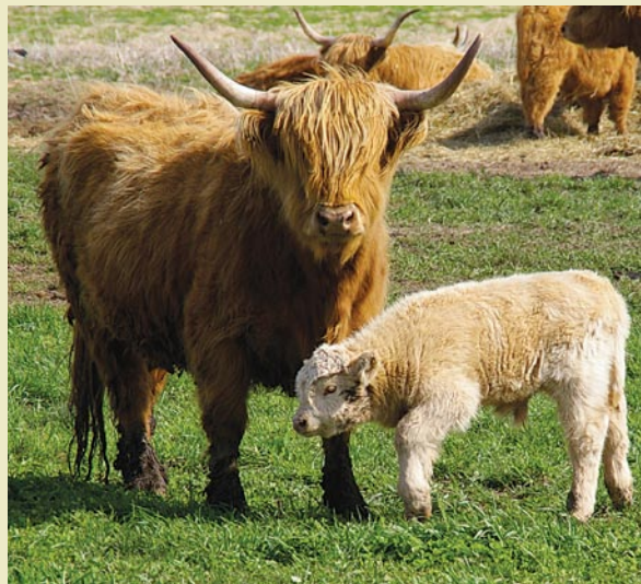
This two-day-old calf will soon join Fountain Prairie's herd of 300 cattle.