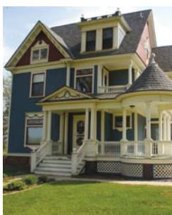
The 5,400 sq. ft. farmhouse B&B is spacious and comfortable with 5 guest rooms, one with a private bath and 2 person whirlpool bath.