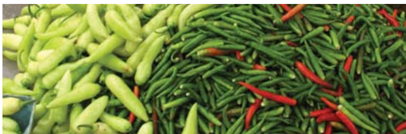
From mild to intense fresh peppers can add flavor and nutrition to any meal.

anaheim is her favorite pepper, the poblano is best for stuffing. With football season underway, she notes a great recipe for stuffed jalapeños. "Clean out the peppers," she says. "Brown Italian sausage, then mix in cream cheese and another cheese. Mix it all together, stuff it into the peppers, and put bread crumbs on top. Bake in a high-temp oven until they get crispy. It's delicious!"