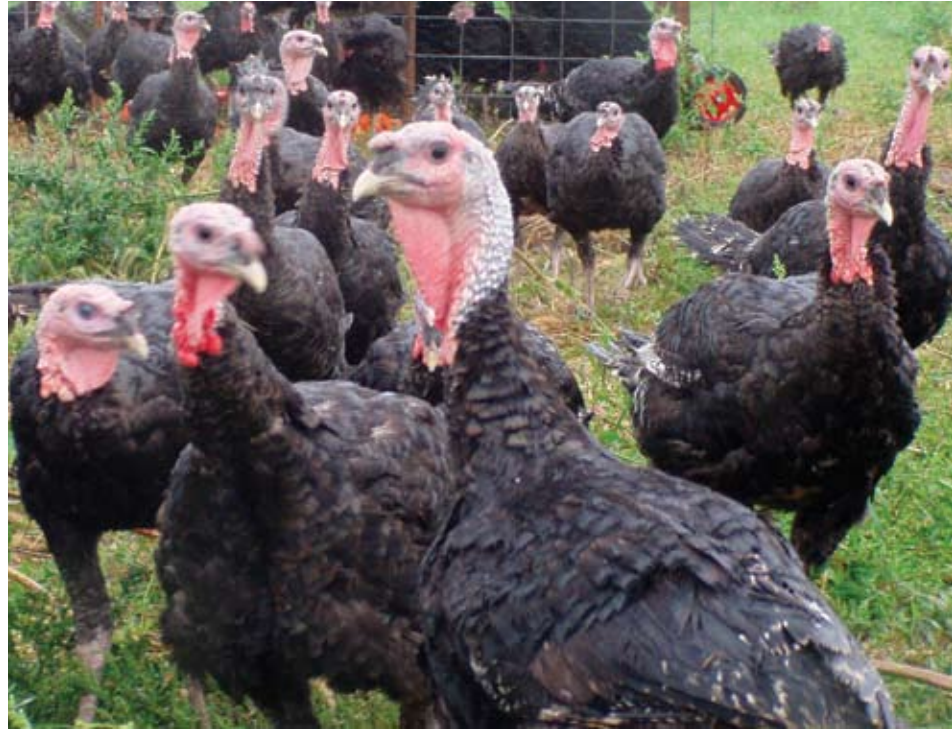
JenEhr’s turkeys chatter happily in their pasture. Grass-fed poultry has a better balance of health-promoting essential fatty acids (omega-3, and omega-6). They also have fewer calories and more vitamin A, vitamin E, and beta-carotene than caged birds.